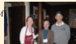
Volunteers in Action B & B COVE Benefit

COVE would like to thank the volunteers that give their time and talents to a variety of services we offer. Check our website for a complete list of volunteers under the "contact us tab", or better yet come see what we are about. We are currently seeking caring, compassionate individuals to fill a variety of positions such as child care, donation sorting, crisis line support, special event support, office assistance, transport of clients or donations and a handy person for repairs around the office and shelter. It is because of volunteers we have been able grow and adapt to meet the needs in our community.