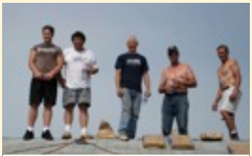
Volunteers in Action Roofing the Office

Community awareness is crucial for prevention of these crimes. We would like the opportunity to speak with your service group about our agency, the services we provide and the volunteer opportunities we offer. COVE is mandated to educate the community about domestic violence and sexual assault and to recruit volunteers to assist us in this endeavor.