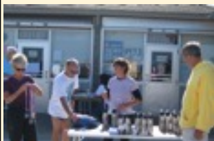
Volunteers in Action Run/Walk Mears State Park