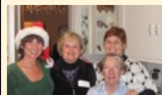
Volunteers in Action Holiday Party

COVE receives both federal and state grants to offset some of our expenses, but also depends on our local communities for much of our funding. Our largest grant is from VOCA (Victims of Crime Act) and, within this grant, we are required to match those monies using volunteer hours, presentations to the community and dollars contributed by