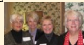
Volunteers in Action Holiday Party

COVE's women's shelter served 220 women and 180 children, provided 10,428 meals and was full or over capacity for 140 nights. We also have extensive "outreach" services; group counseling, court accompaniment, personal protection order filing, hospital response in cases of sexual assault and advocacy for women who are unable to advocate for themselves because of the trauma they have suffered.