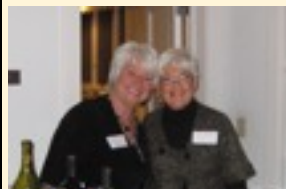
Volunteers in Action Holiday Party

For 30 years COVE (Communities Overcoming Violent Encounters) has been providing "a shelter in the storm" to individuals and families experiencing domestic and/or sexual violence and homelessness in Lake, Mason and Oceana counties. Last year